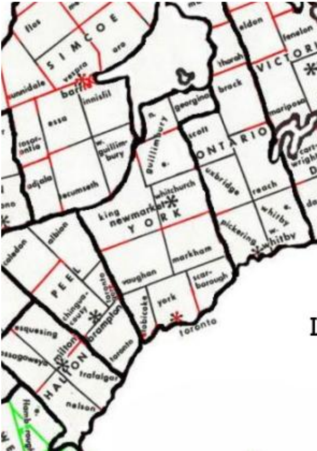
Figure 02: Map of the County of York and surrounding counties. Note especially Markham and York Townships in York County, places where many of the early Haacke family members lived and worked. One can also locate other townships of relevance to the Haacke family.