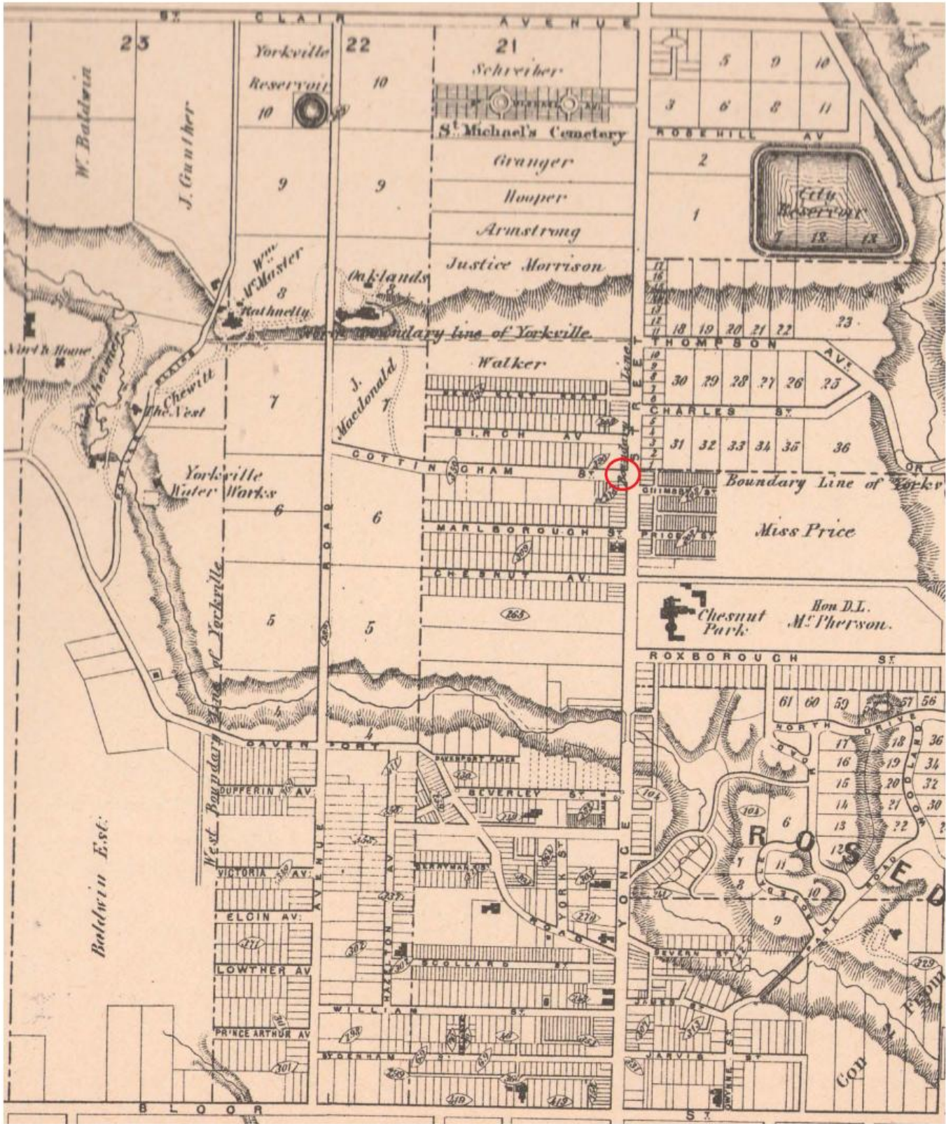
Figure 01: Map showing Peter Hutty's home on Cottingham near Yonge Street (circled). Note the proximity to Yorkville and the Nordheimer and Rosedale Ravines. These ravines flow from the Don River, which is also nearby. (Reference Figure 02 in Appendix for a county-township perspective of the area).